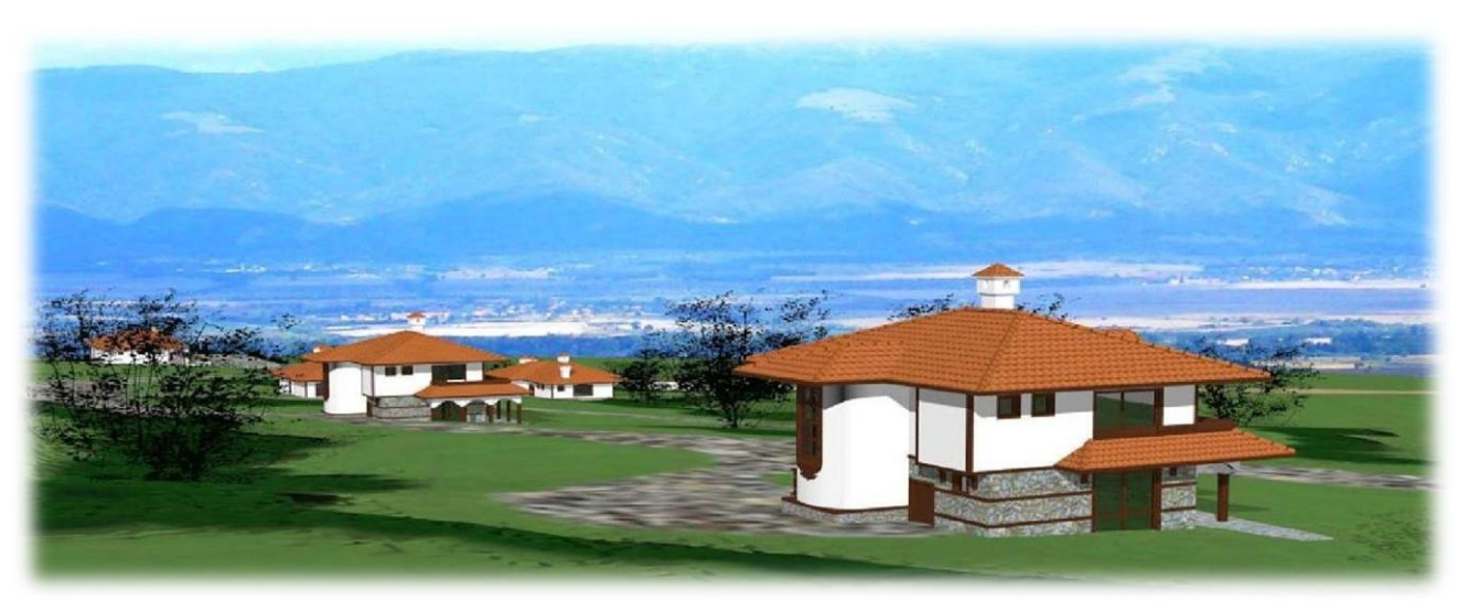
The plot is located in the foothills of Sredna Gora mountains between rose and lavender gardens, in a quiet area with beautiful panoramic view to Stara Planina mountains.