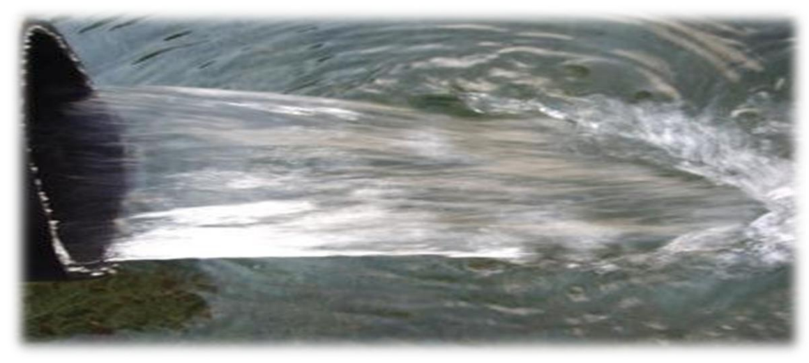
(36 °C.Depth of the probe of 764 metres)

Just a few kilometers away from the plot there is a warm healing mineral water spring