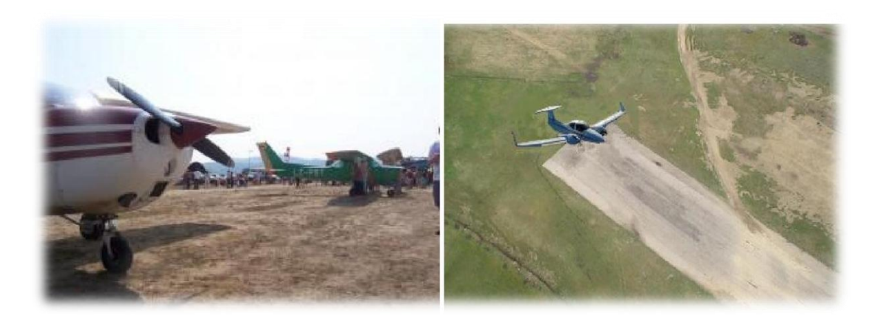
The location of the land in Bulgaria

Two air strips are located 5 km in northern direction and 18km to the south of the land.